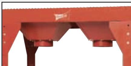
Optional square to round flanges