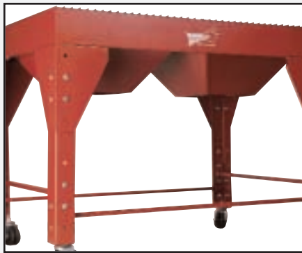
Standard hopper discharge