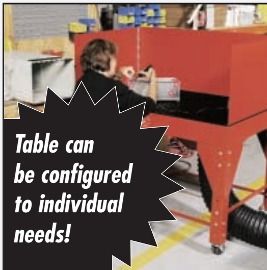
Table can be configured to individual needs!