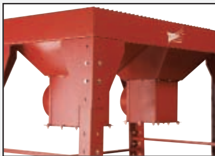
Optional horizontal transitions