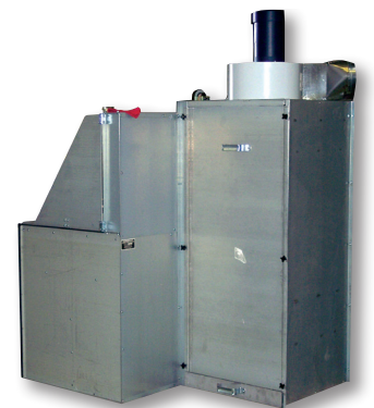
Rear View with Dust Collection Filter Housing