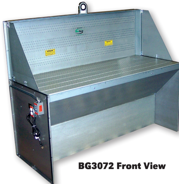
BG3072 Front View

The DualDraw approach to downdraft quality and performance is unique in the marketplace – we guarantee your satisfaction.